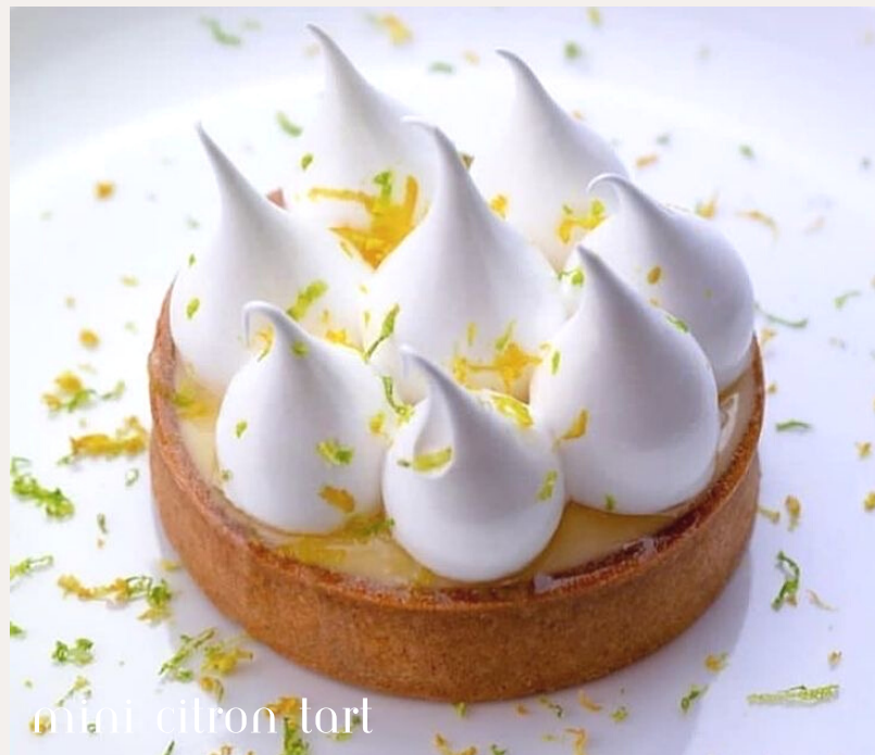
mini citron tart